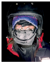
Flirting with frostbite